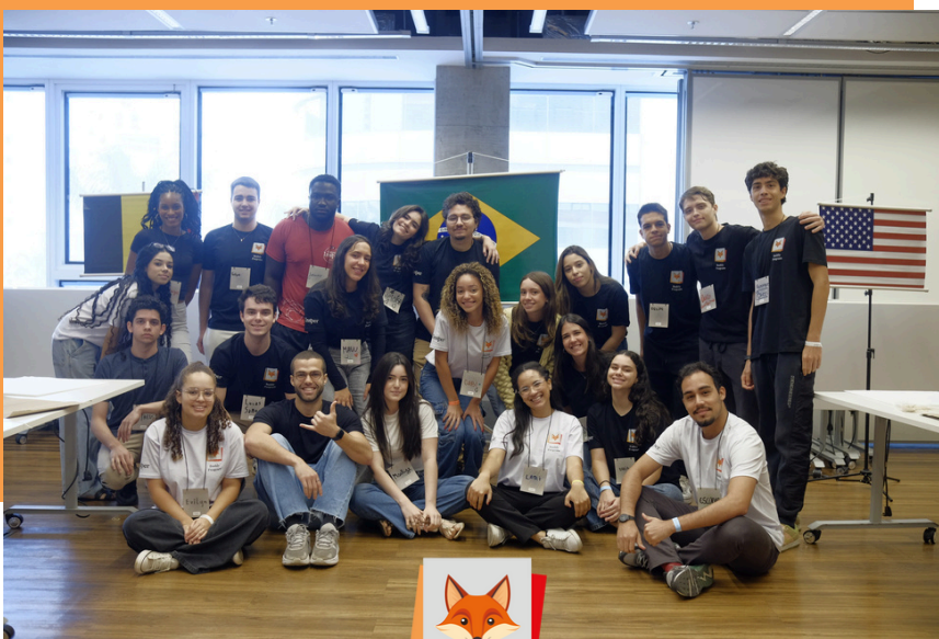
Insper Buddies 2025.2

At Insper, we offer the Insper Buddy Program. Buddies help facilitate connections with local students both on and off campus, offering opportunities to immerse themselves in Brazilian culture, enjoy meaningful experiences, and build lasting friendships.